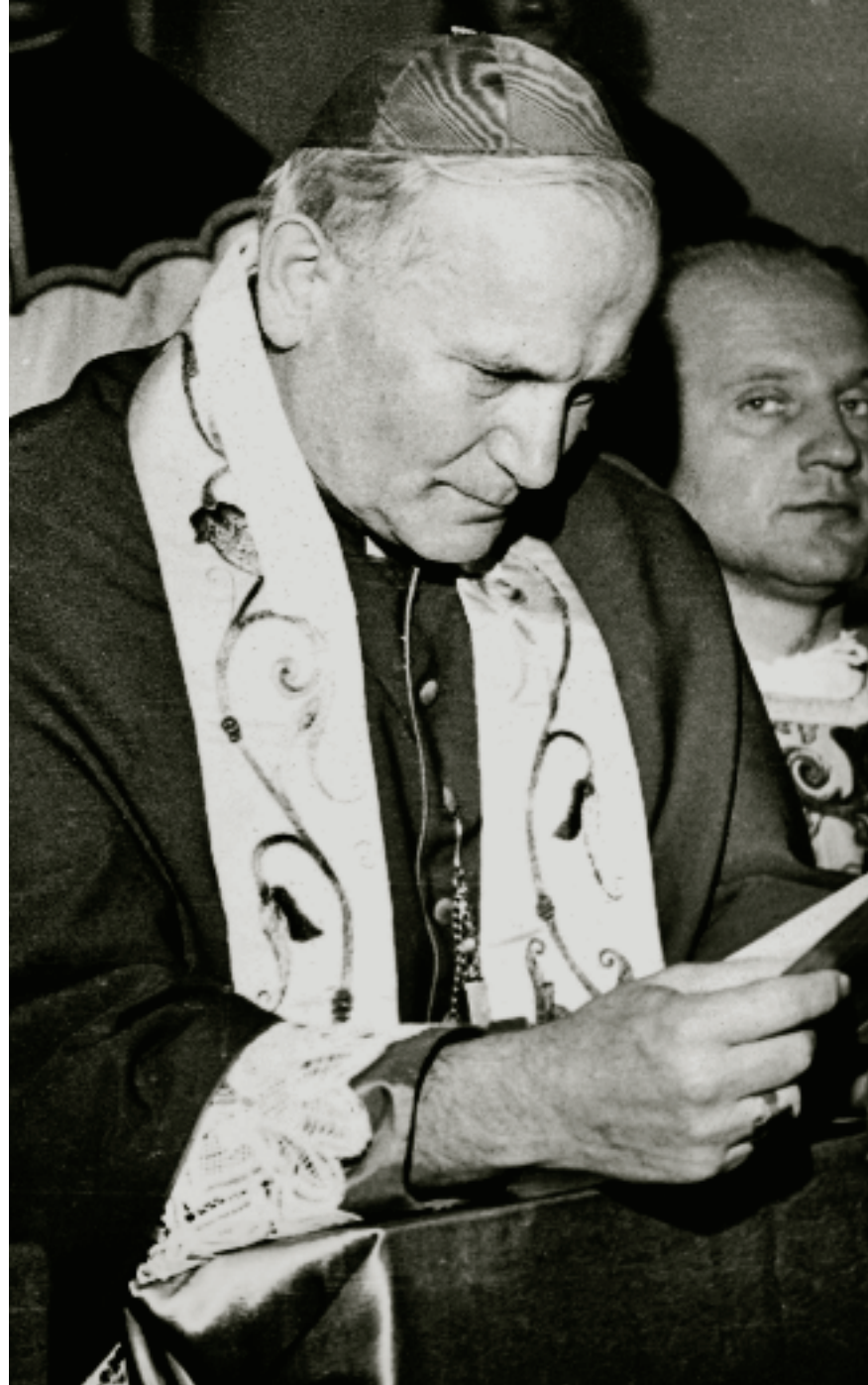
Cardinal Karol Wojtyła during his visit to Wadowice

Photo from the collection of The Holy Father John Paul II Family Home Museum in Wadowice