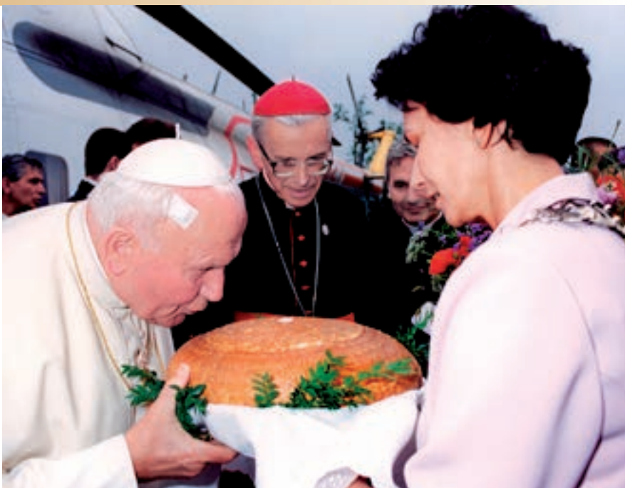
John Paul II in Wadowice – the third visit on June 16, 1999. Bread and salt welcome in hometown

It is with great reverence that I kiss the threshold of the House of God – the parish church in Wadowice, and inside the church I kiss the baptismal font at which I was baptized into Christ and admitted to the community of His Church. It is in this church that I went to confession for the first time and made my First Communion. It is here that I was an altar boy. It is here that I thanked God for the gift of priesthood and – already as an archbishop of Krakow – celebrated my silver jubilee of priesthood. Only the One who gives all the graces knows how much good and how many graces I have found in this church and in this parish community. It is Him – one God in Trinity – that I worship today on the threshold of this church.