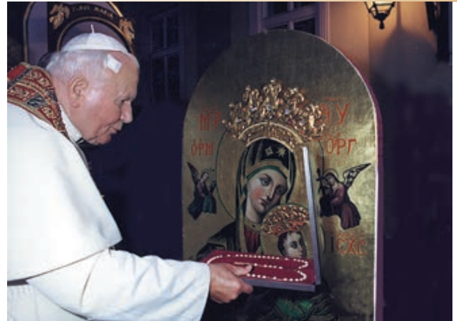
John Paul II in Wadowice – the third visit on June 16, 1999

Photo from the archives of the Church of the Presentation of the Blessed Virgin Mary in Wadowice