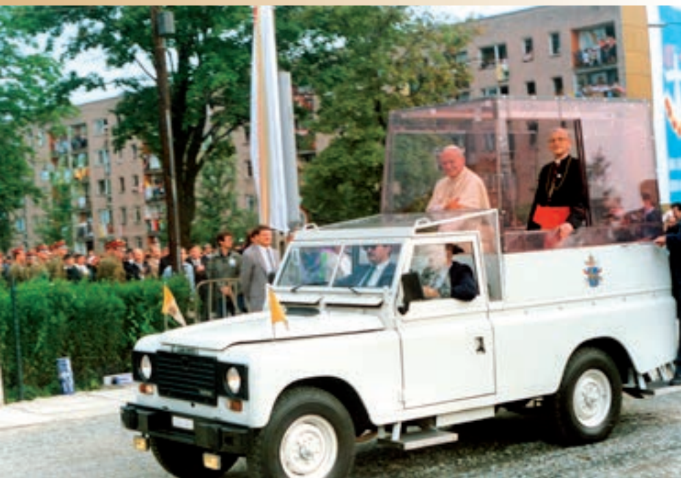
John Paul II in Wadowice – the second visit on August 14, 1991