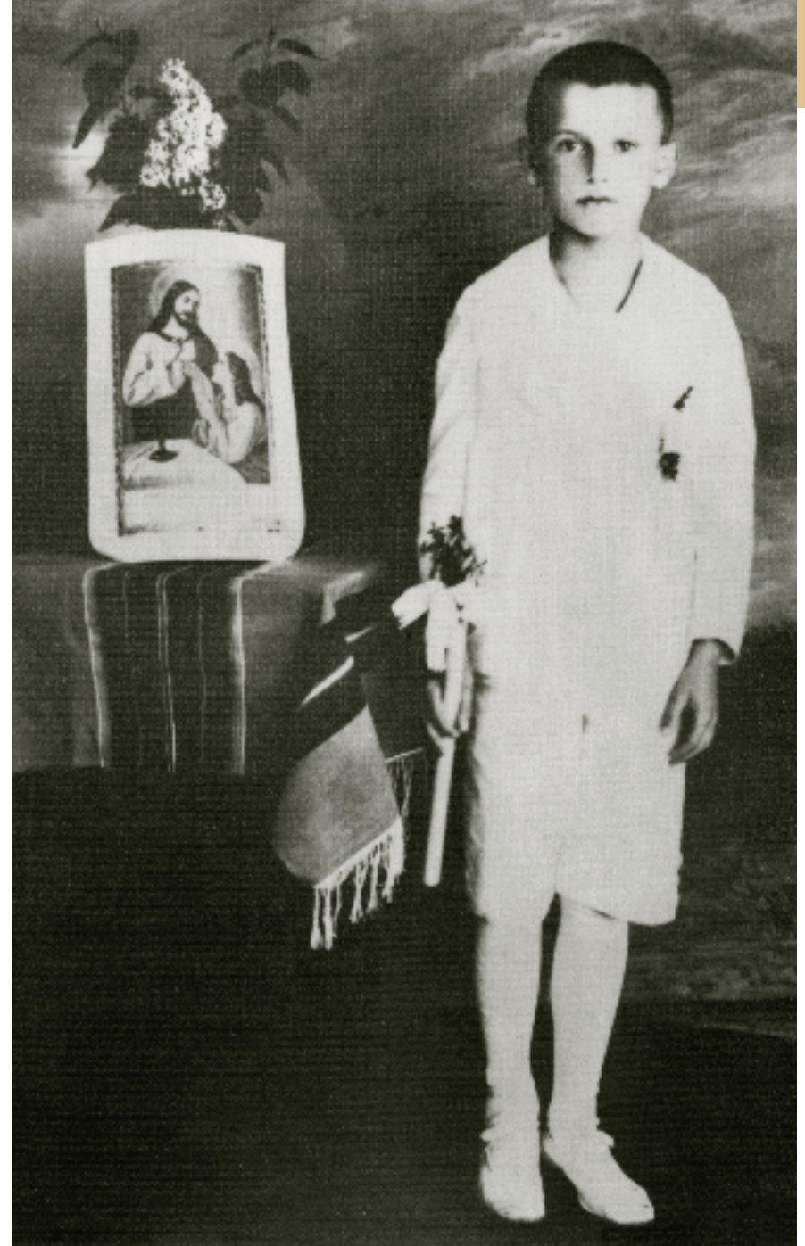
Karol after the First Holy Communion