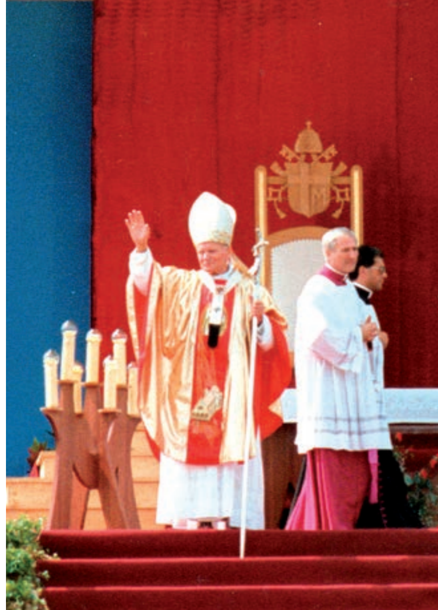
John Paul II in Wadowice – the second visit on August 14, 1991