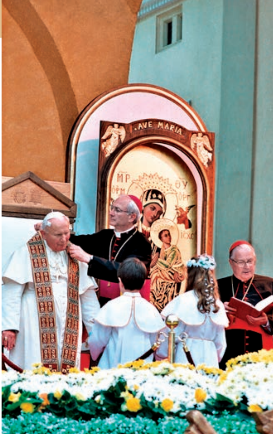
John Paul II in Wadowice – the third visit on June 16, 1999