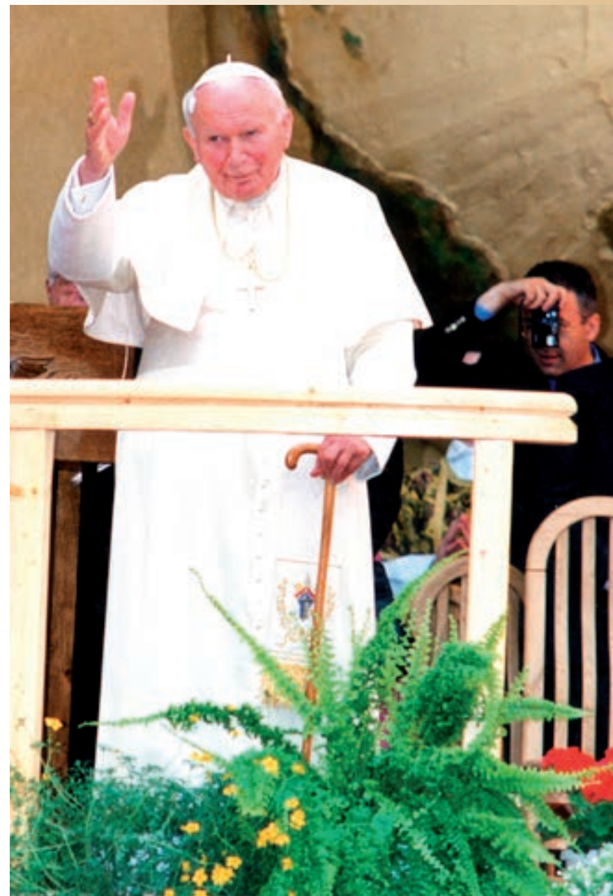
John Paul II in Wadowice – the third visit on June 16, 1999