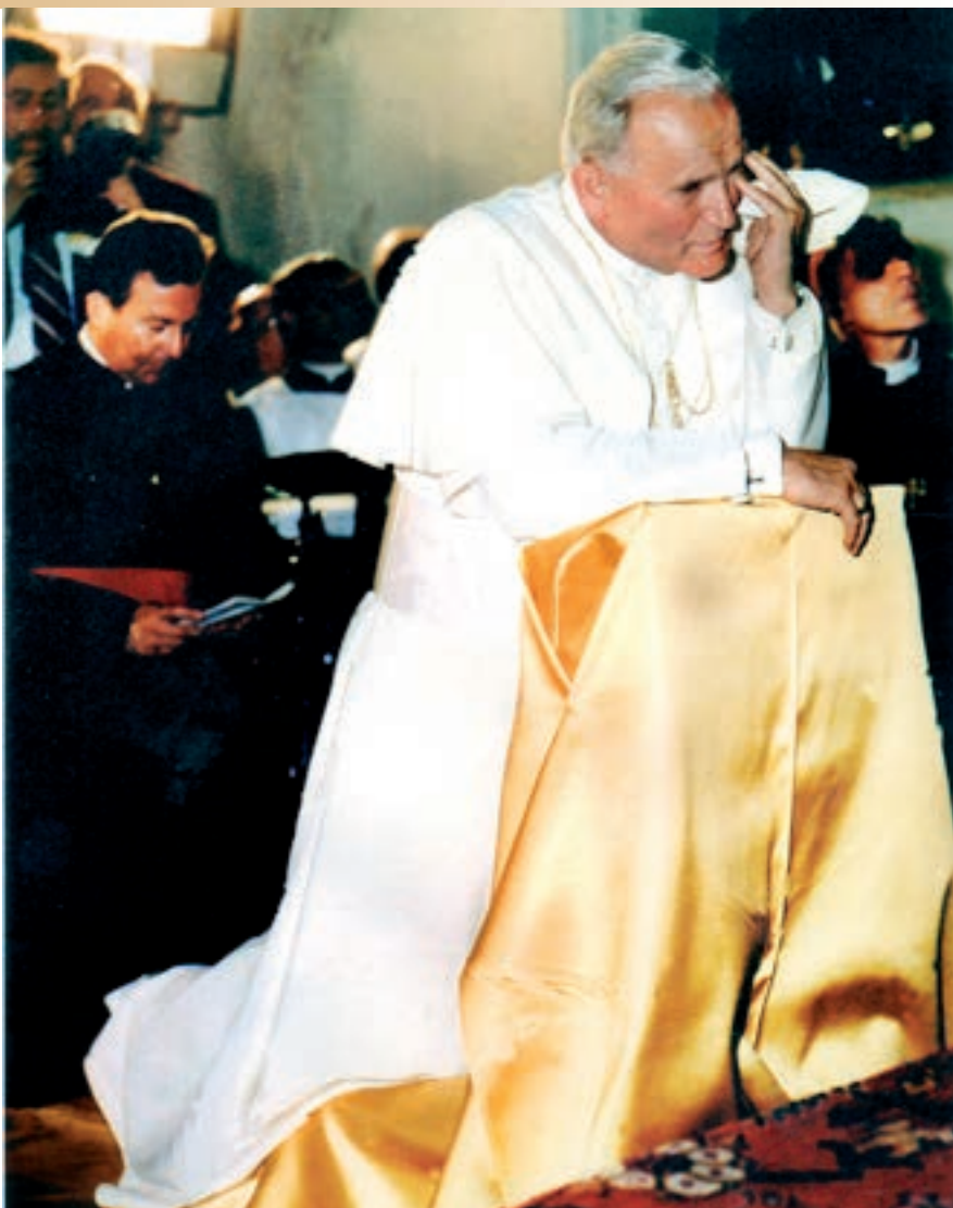
John Paul II in Wadowice – the first visit on June 7, 1979