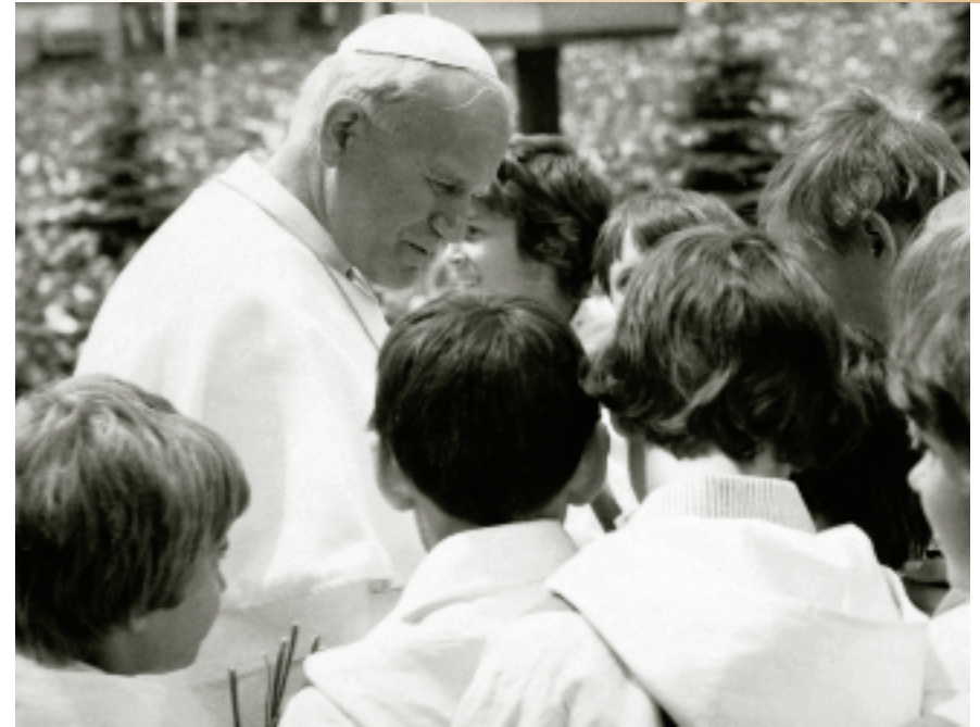
John Paul II in Wadowice – the first visit on June 7, 1979