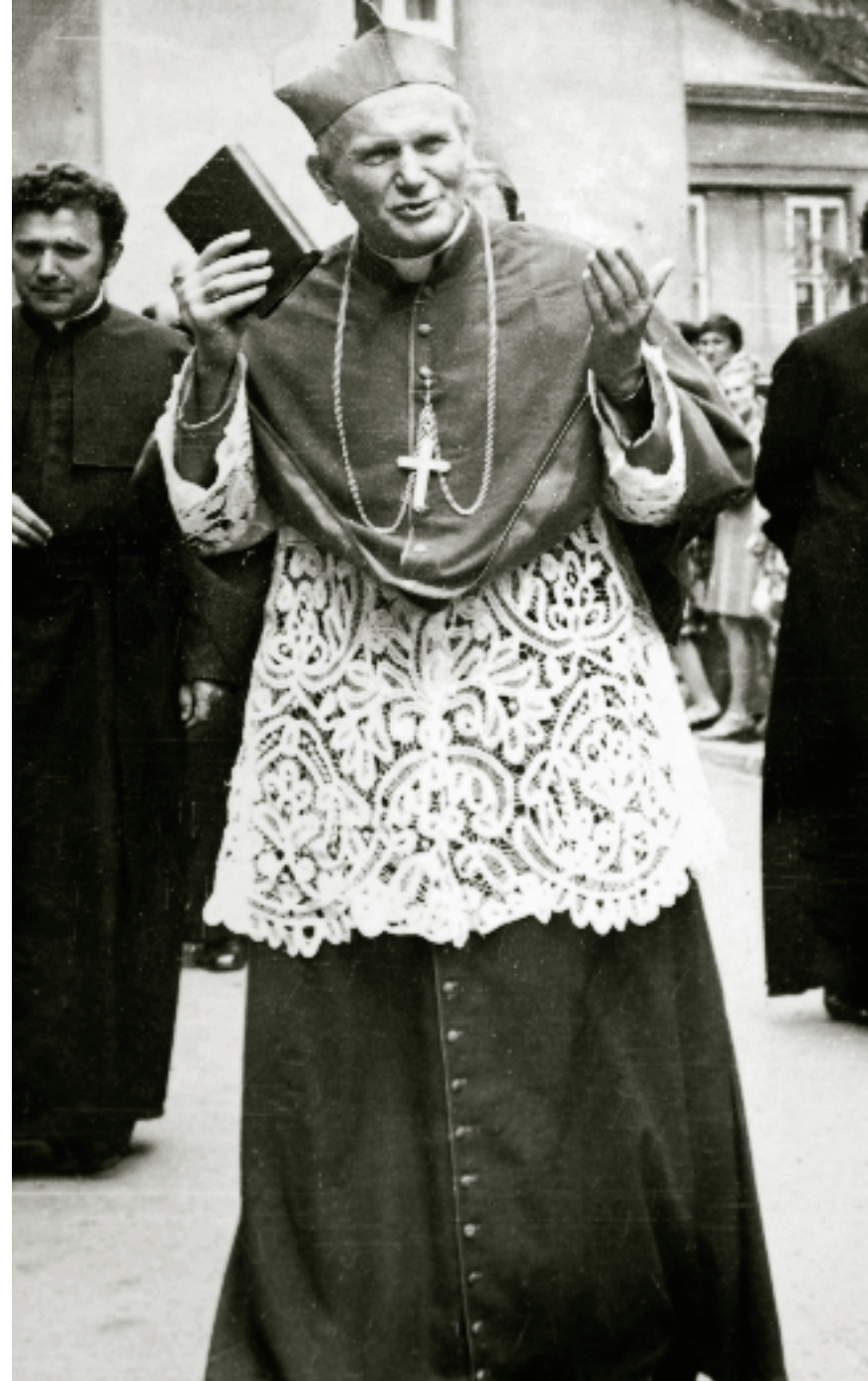
Cardinal Karol Wojtyła in Wadowice – a pastoral visit

26.11.1967 – Karol Wojtyła celebrates his Pontifical High Mass in the church in Wadowice