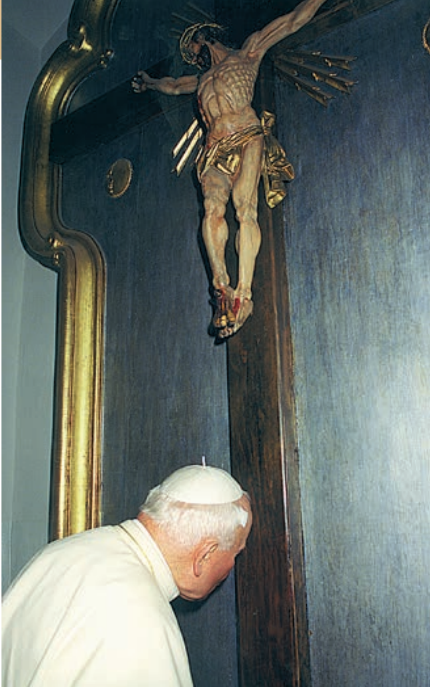
John Paul II in Wadowice – the third visit on June 16, 1999

Photo from the archives of the Church of the Presentation of the Blessed Virgin Mary in Wadowice