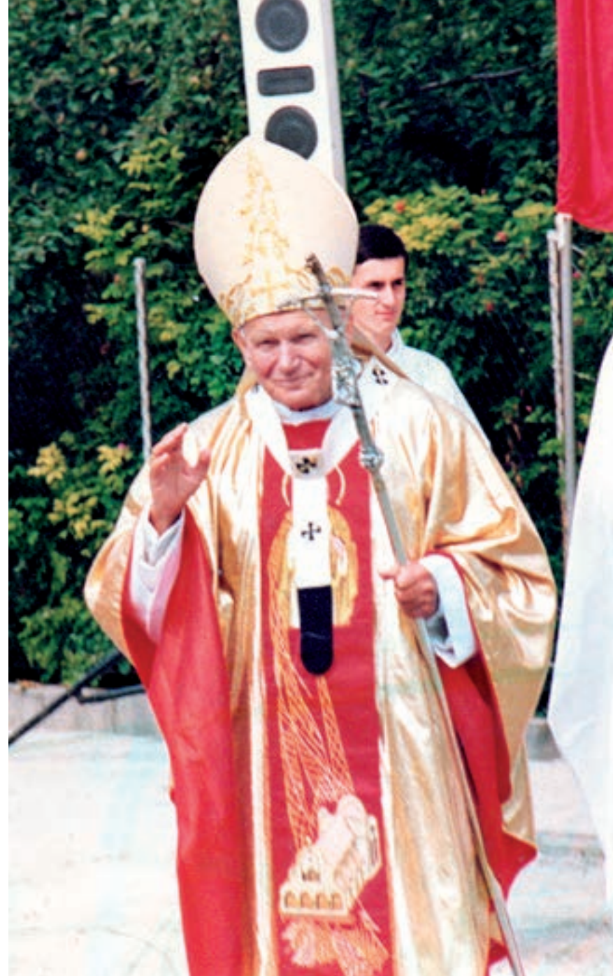
John Paul II in Wadowice – the second visit on August 14, 1991