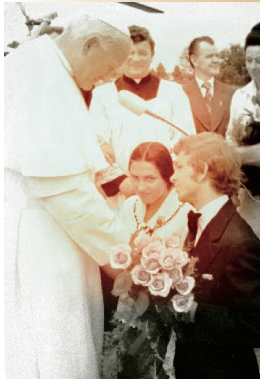
John Paul II in Wadowice – the first visit on June 7, 1979 Photo by [Andrzej Leń]