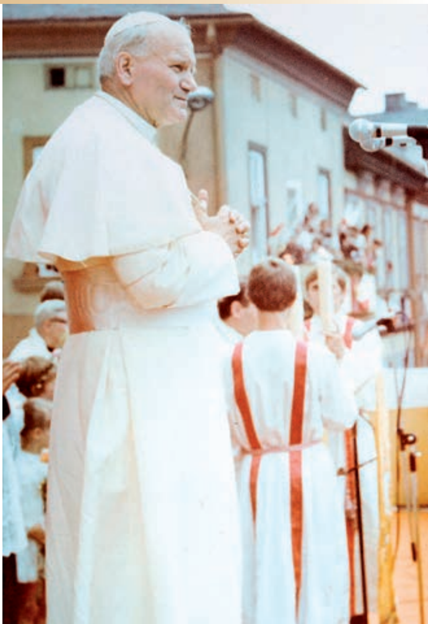
John Paul II in Wadowice – the first visit on June 7, 1979 Photo by [Andrzej Leń]