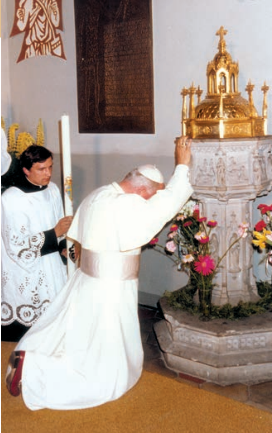
John Paul II in Wadowice – the first visit on June 7, 1979

Photo from the archives of the Church of the Presentation of the Blessed Virgin Mary in Wadowice