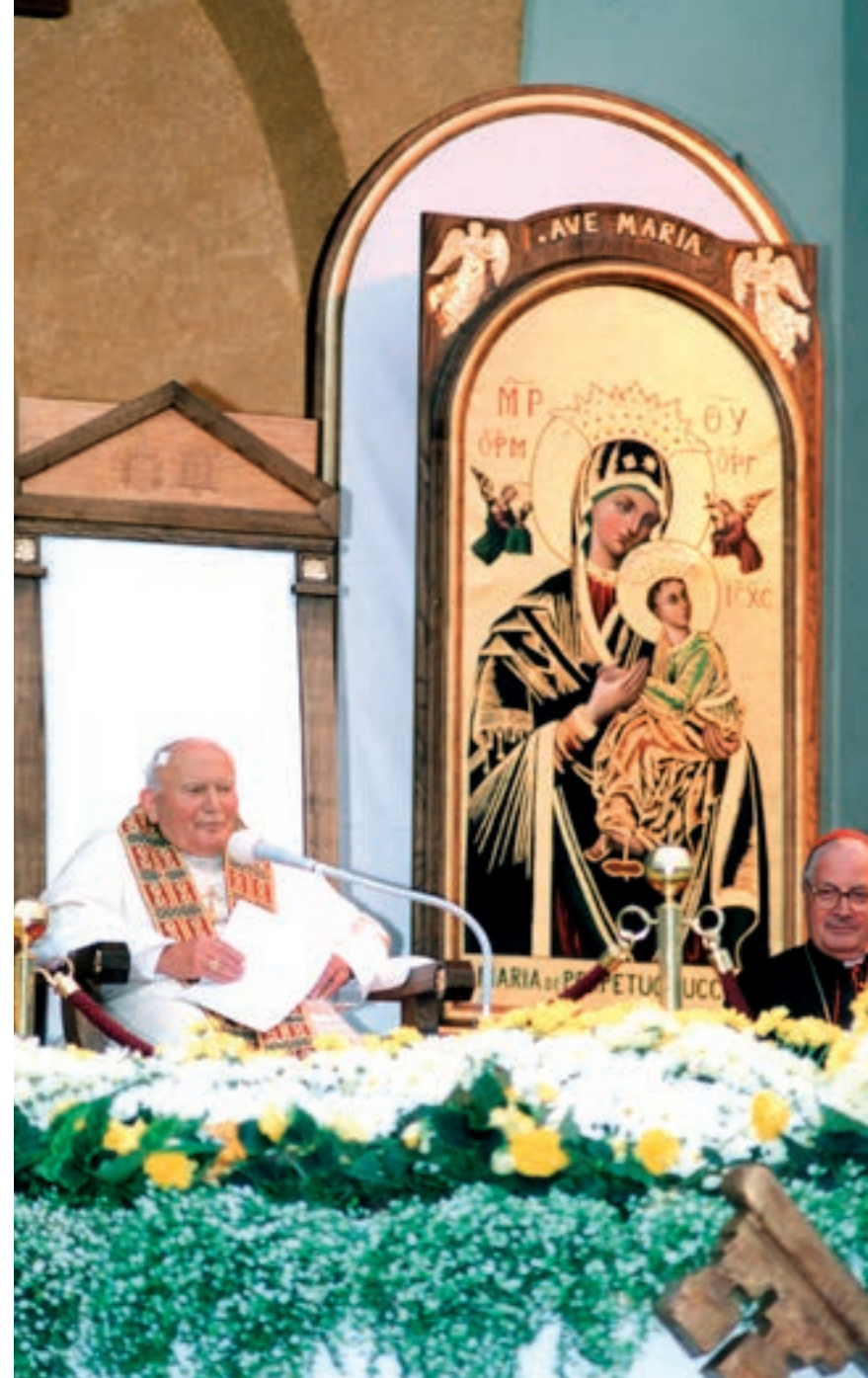
John Paul II in Wadowice – the third visit on June 16, 1999

19.08.2002 – a helicopter with Pope John Paul II flies over Wadowice